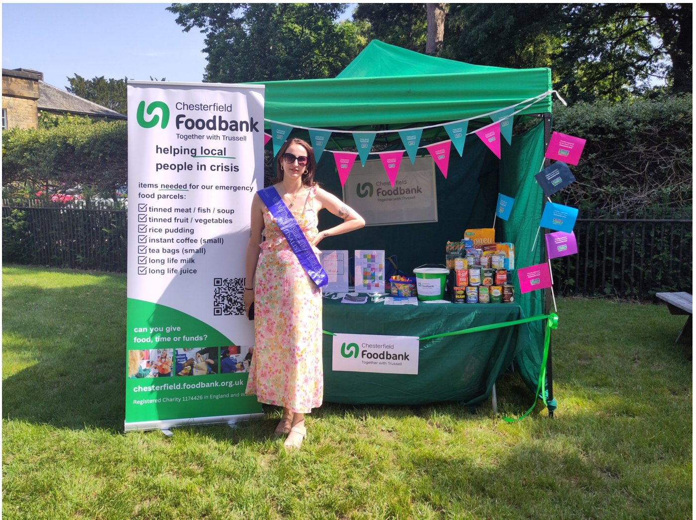
Eckington Classic Car & Bike Show

A huge thank you to Chesterfield Rotary Club for inviting us to be part of this fantastic annual event. Our volunteers enjoyed a wonderful day at the show, and we were delighted to be joined by Miss Derbyshire , who came to help raise awareness of the work of Chesterfield Foodbank.